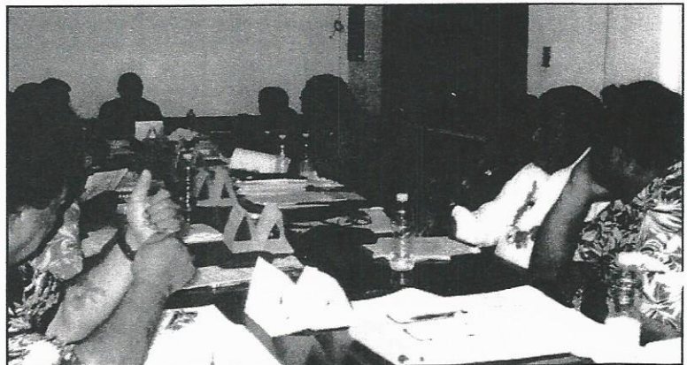
Commission members tackled their tasks at their Conference

The Chuuk Election Commission has 4-6 months after it received the report and recommendation of the Commission, according to law.