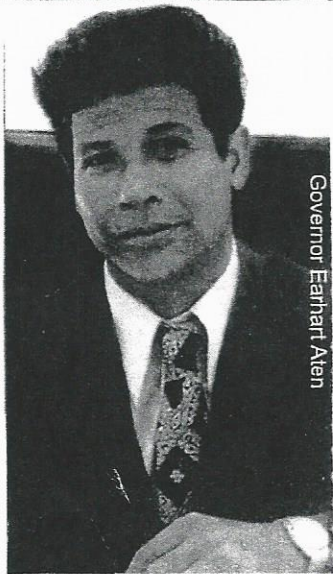
Governor Erhart Aten

Governor Erhart Aten First Governor of Chuuk and True Father of the Movement for the Independence of Chuuk